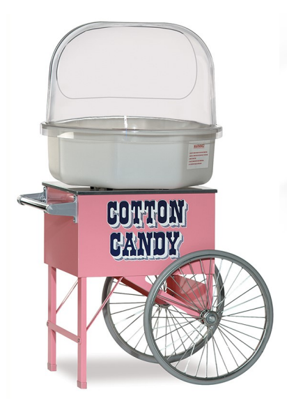
Pink Cotton Candy Cart w/Machine (Dome Additional)