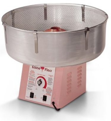
Tabletop Cotton Candy Machine