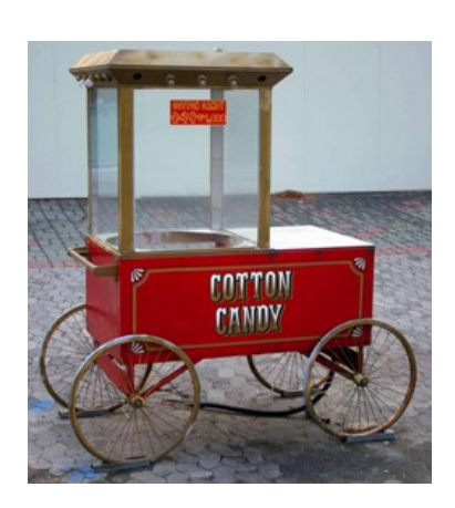
4-Wheel Cotton Candy Cart w/Lighted Dome

Size and design is subject to availability.