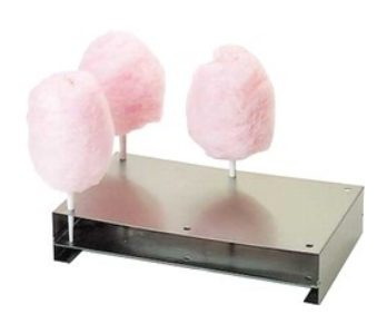
Cotton Candy Tray