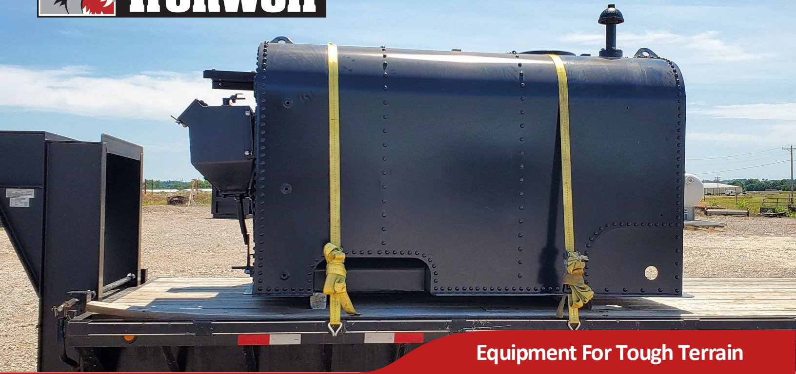
Equipment For Tough Terrain