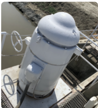
Canal Lift Pumps