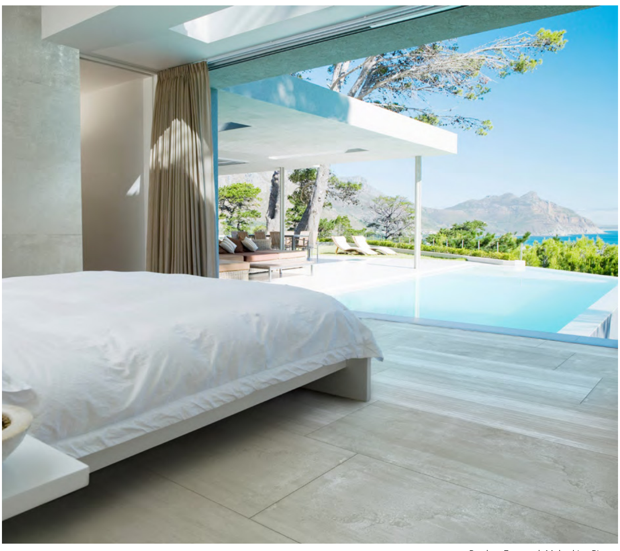
Product Featured: Melted Ice Rigato