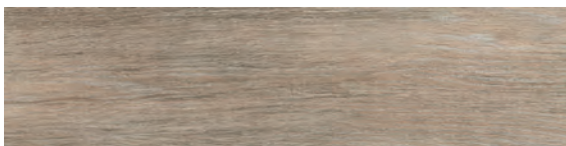
WIS11907 LARCH US Honed Bullnose 6"x24"