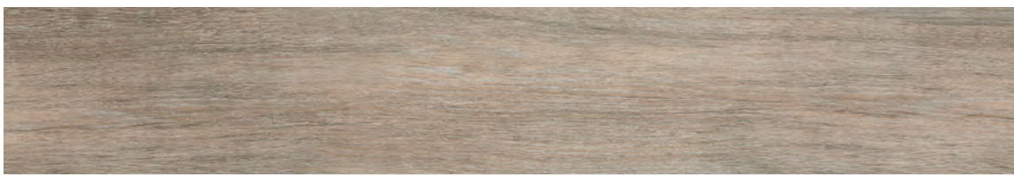
WIS11829 LARCH US Honed 8"x48"