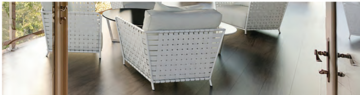
Product Featured: Larch Us