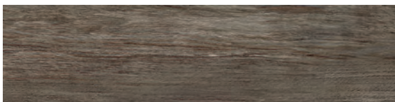
WIS11906 ELM US Honed Bullnose 6"x24"