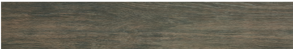
WIS11827 BEECH US Honed 8"x48"