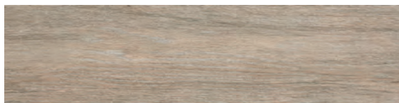
WIS11860 LARCH US Honed 6"x24"