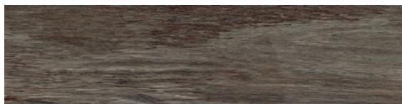
WIS11859 ELM US Honed 6"x24"