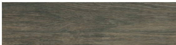
WIS11858 BEECH US Honed 6"x24"