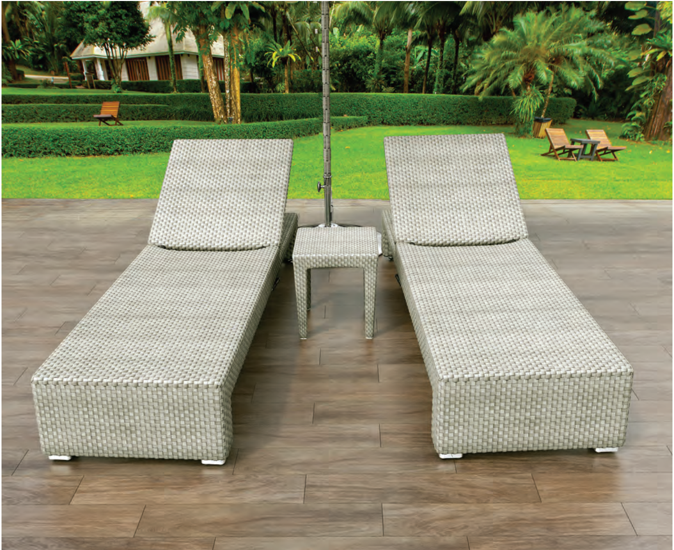
Product Featured: Larch Us