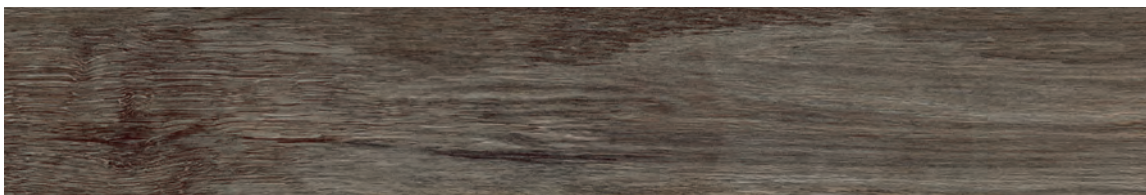
WIS11828 ELM US Honed 8"x48"